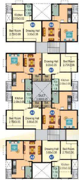
Stilt First Floor Plan