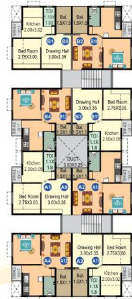
Stilt Ground, Stilt Second Floor Plan