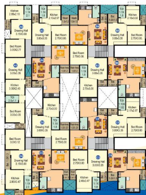
Stilt First Floor Plan