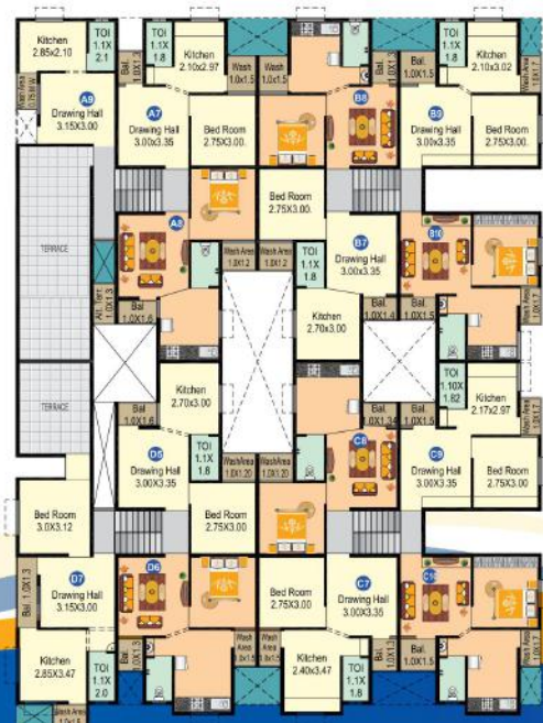
Stilt Second Floor Plan