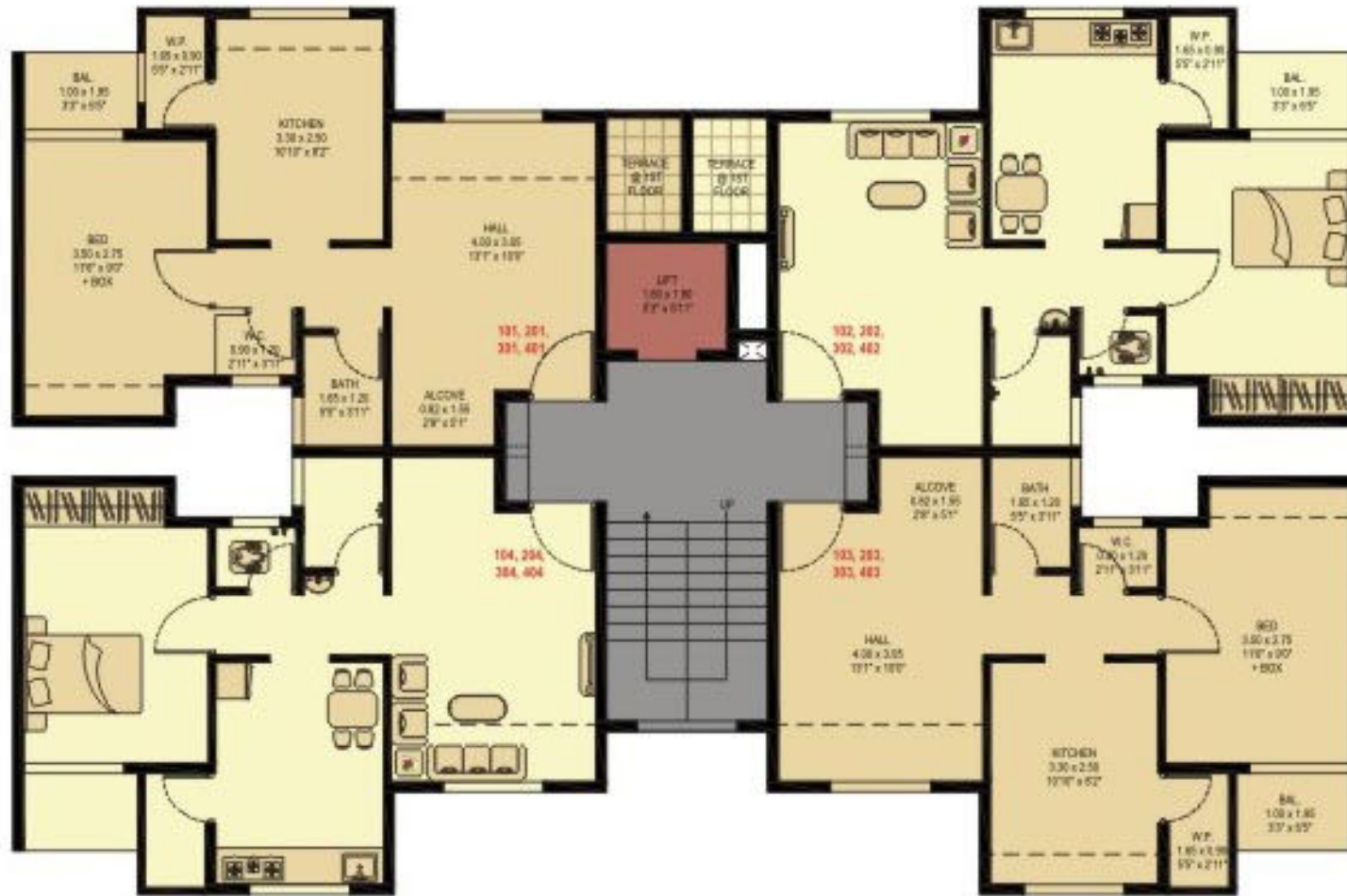
TYPICAL FLOOR PLAN FOR 1 BHK