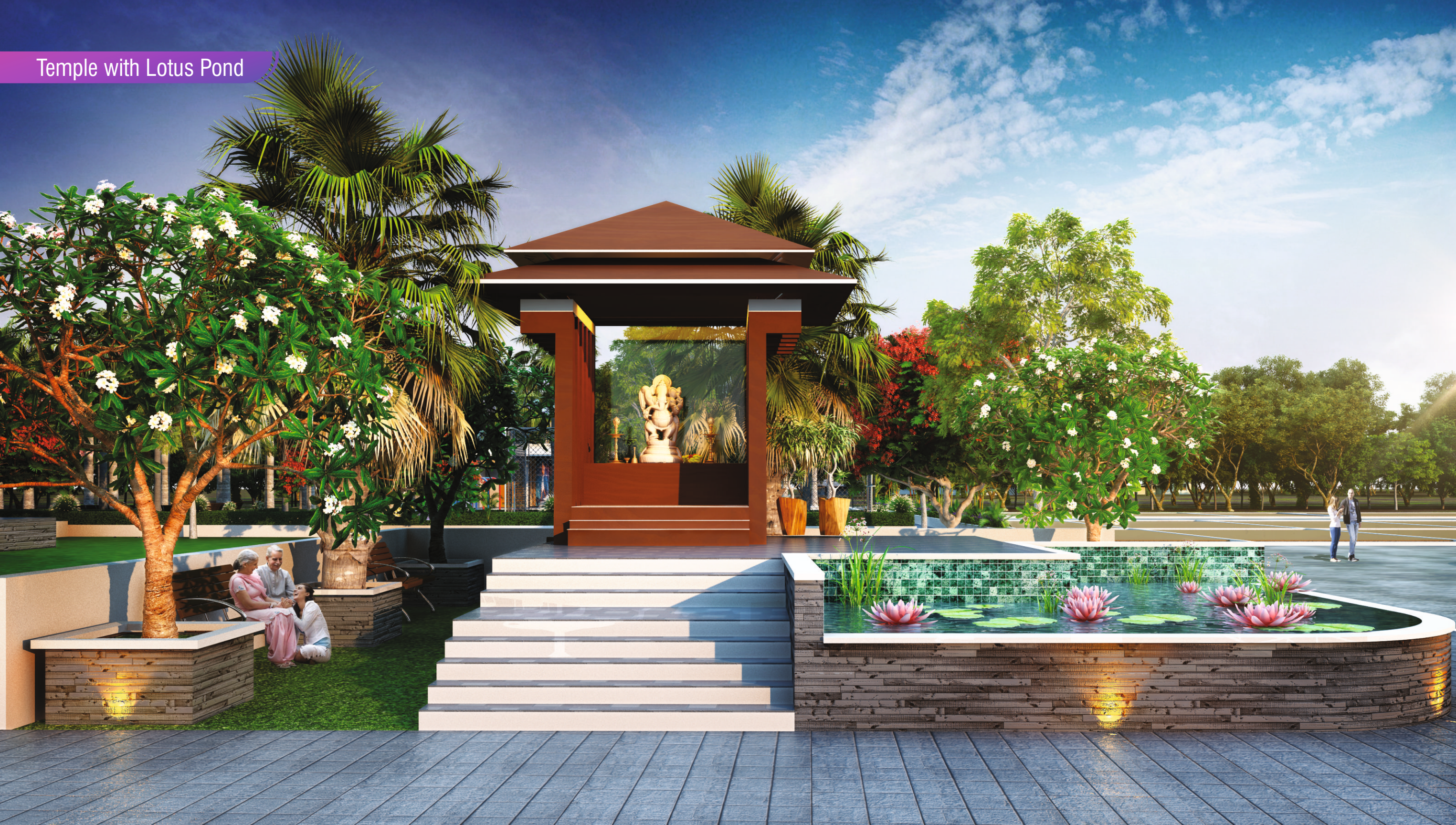
Temple with Lotus Pond